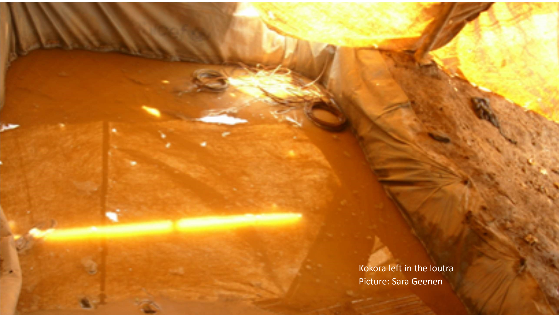
Kokora left in the loutra