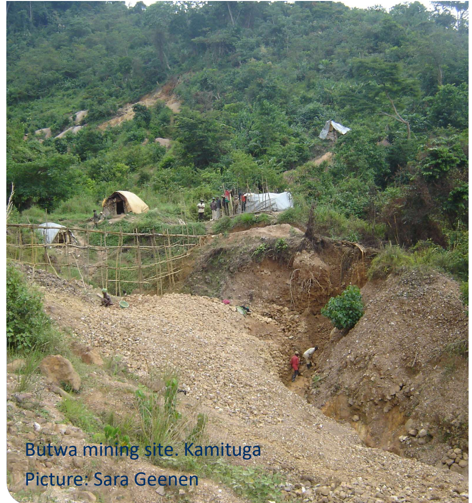
Butwa mining site. Kamituga