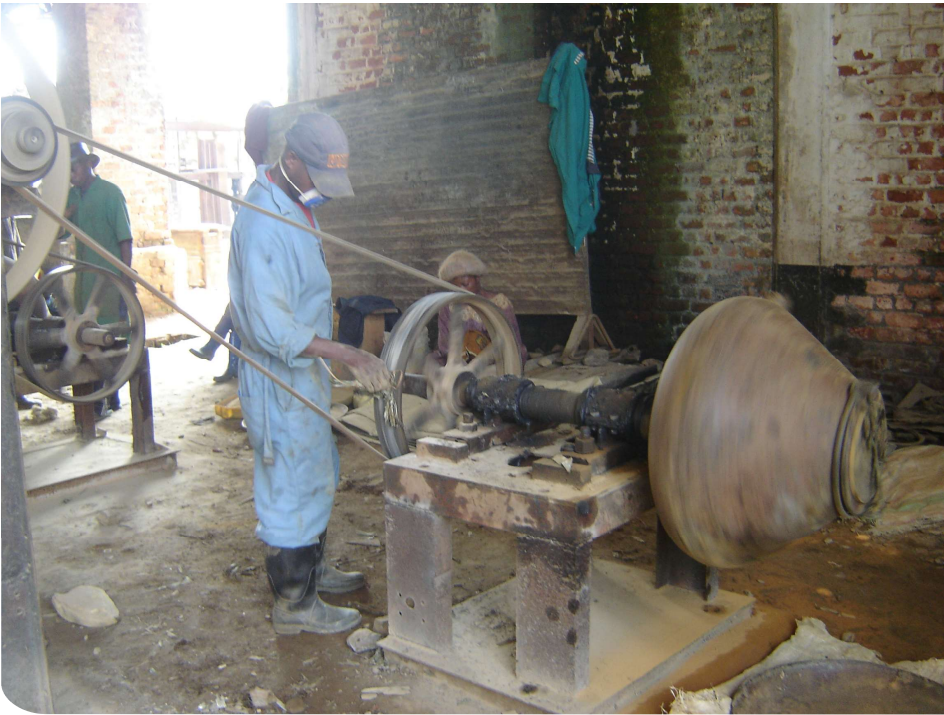
Ball mills in a colonial workshop. Kamituga