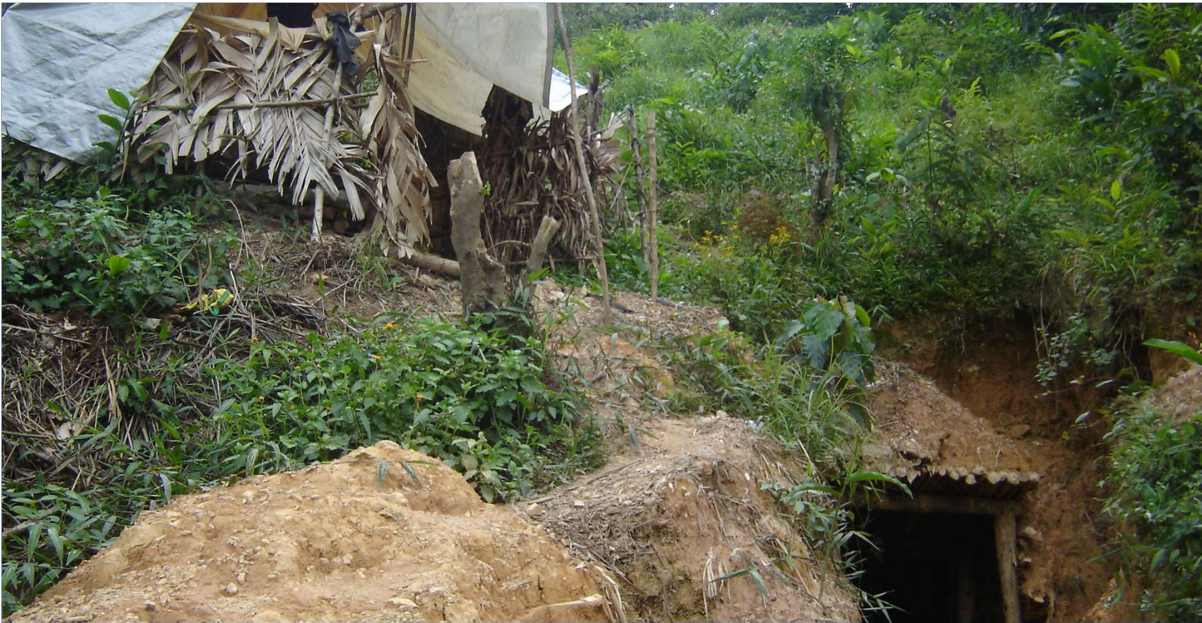
Underground pit . Kamituga