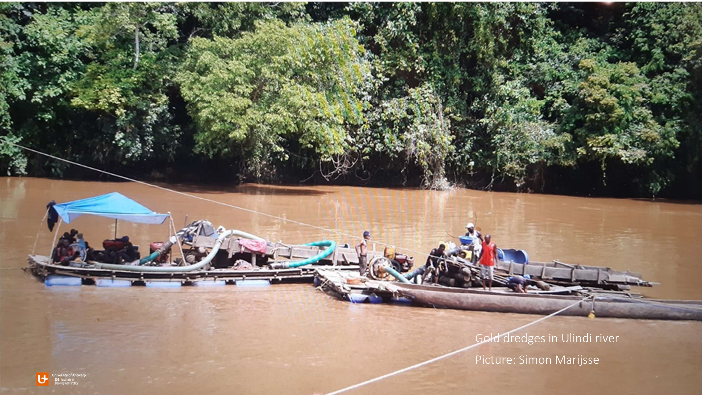
Gold dredges in Ulindi river