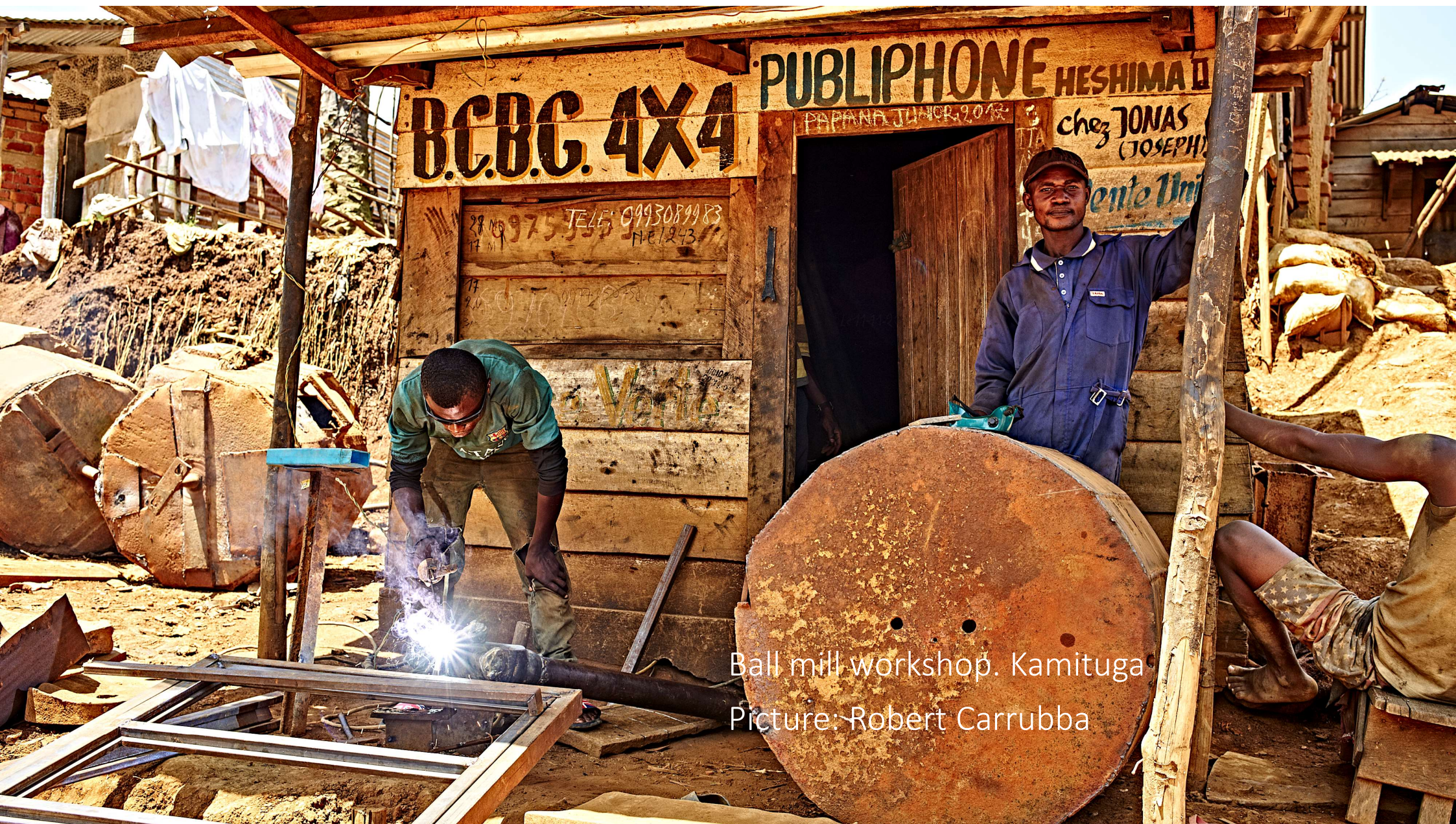
Ball mill workshop. Kamituga