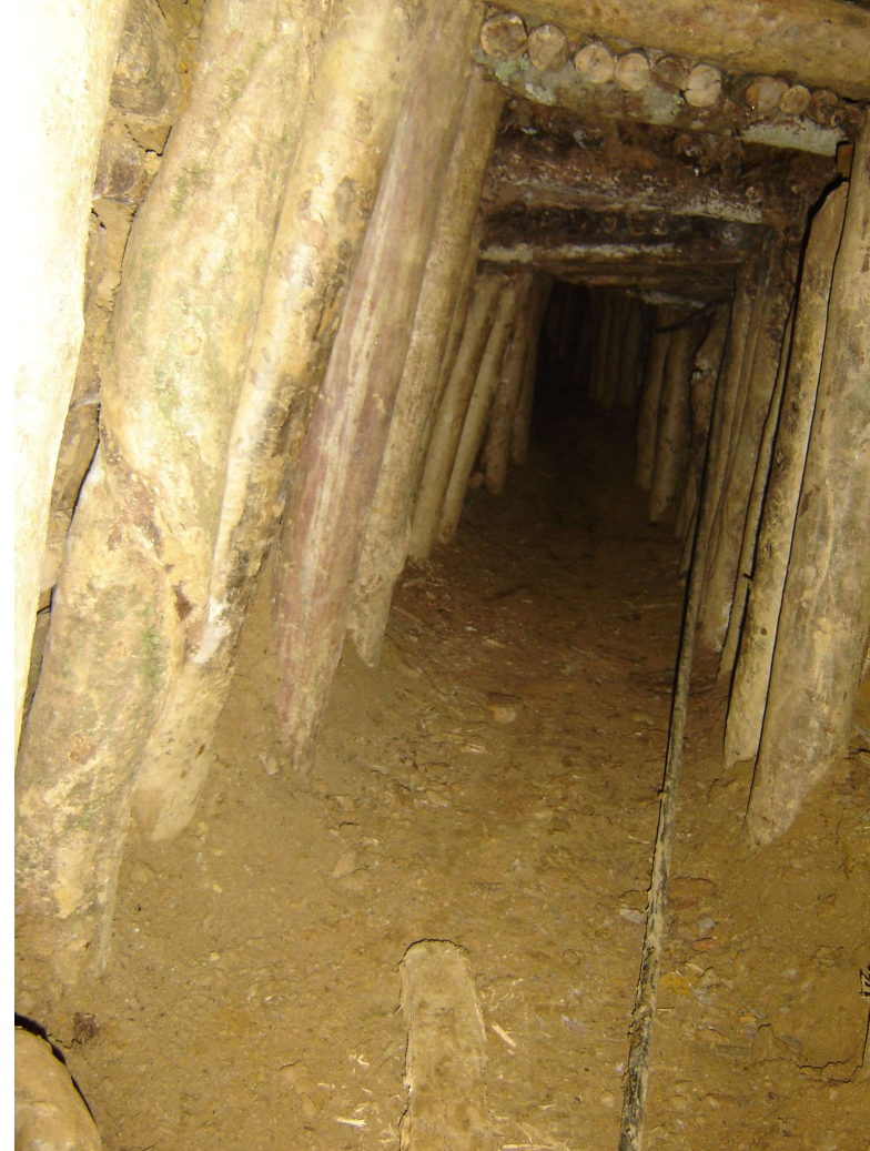
Wooden constructions in the tunnels. Kamituga